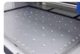
A wide flat vise up to 300mm x 200mm